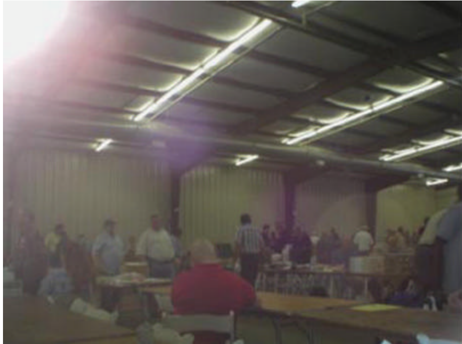
Scouting for Buyers