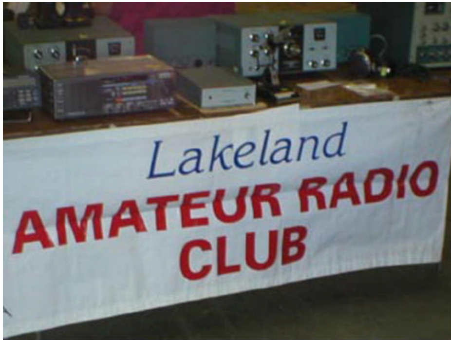
Lakeland Amateur Radio Club Banner