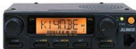
Base Alinco DR-140 2 meter