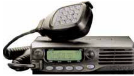
Mobile Radio Kenwood TM-271A 2 meter