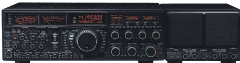
FT DX 9000MP Yeah Right, me with a $12,000 dollar Ham Radio? Vikki says Dream on hehe