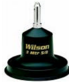
Mobile Antenna Wilson 2m 5/8