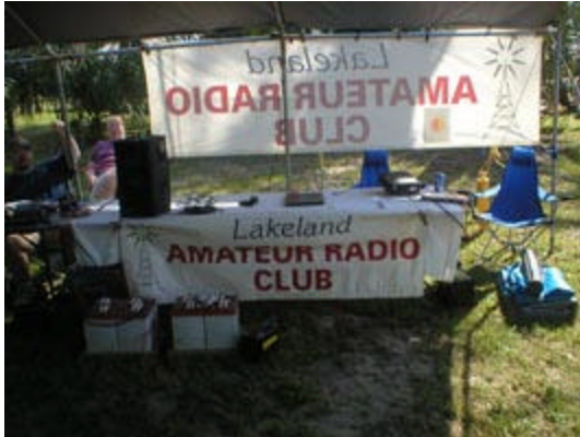
Radios & Banners